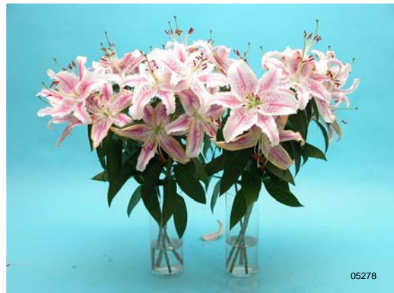
Treatment: Chrysal Clear Prof. A&L T-Bag during transport and shop phase / Chrysal Clear A&L cut flower food during consumer phase Total vase life: 12 days Photo taken: day 11