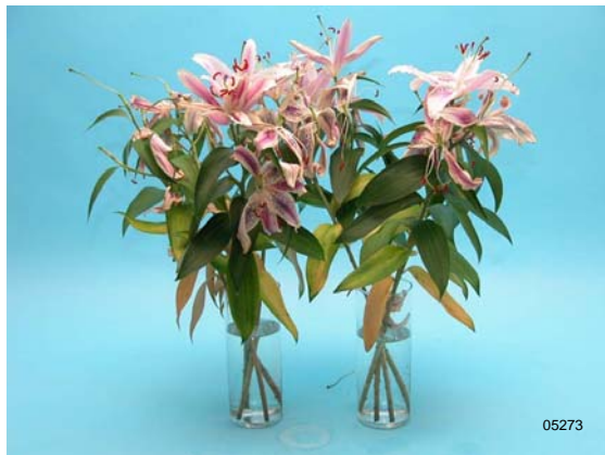
Treatment: water during transport, shop and consumer phase Total vase life: 10 days Photo taken: day 11